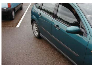
Parking in a public car park