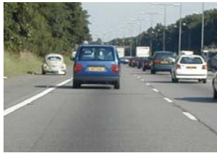
Motorway with car on hard shoulder

How good a driver do you think you are? What would be your reaction in these situations: