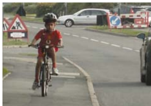
Oncoming cyclist on the pavement